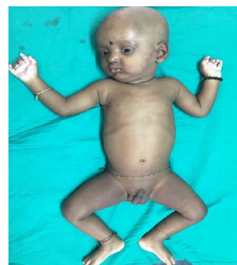
Fig. 2: Typical facies of the patient with anhidrotic ectodermal dysplasia