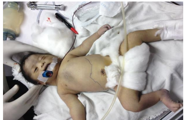
Fig. 1: Clinical photograph of neonate showing down facies, echymotic patch on trunk, swollen and cyanosed right fore-arm, enlarged liver & Spleen

Differentiation between congenital leukaemia and transient myeloproliferative disorder is difficult as both may have same haematological symptoms, the only difference being non-hematopoietic tissue infiltration (skin and central nervous system) which is commoner in congenital leukaemia. (5,6) While the presence of trisomy and other abnormalities of chromosome 21 in baby goes in favour of diagnosis of transient myeloproliferative disorder. So as stated by Kshirsagar et al (3) peripheral blood smear examination in DS children during neonatal period can be of help in early detection of these haematological conditions with varied prognosis.