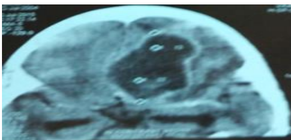
Fig. 4: Large brain abscess on CT scan of brain