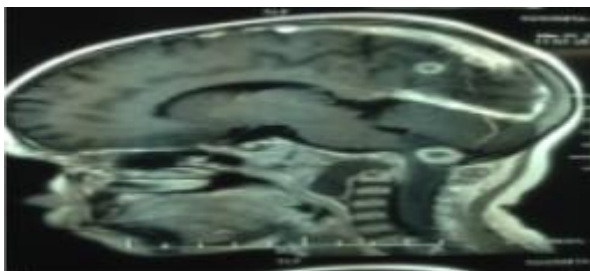
Fig. 1: Ring enhancing lesion on CT scan of brain