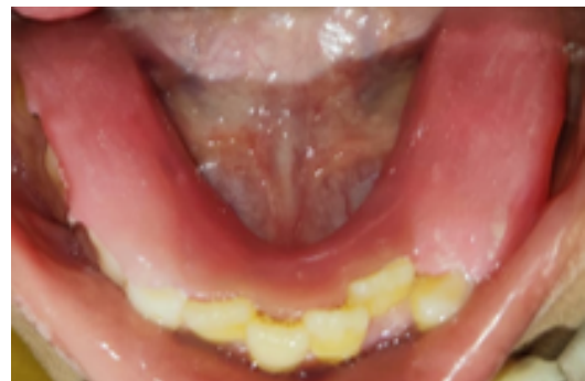
Fig. 8: Figure 8