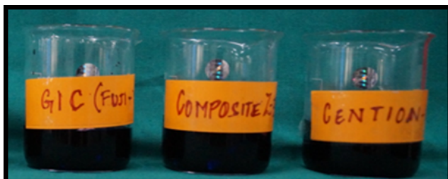
Fig. 2: Samples in dye penetration