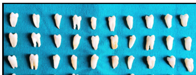
Fig. 1: Premolar teeth specimens

Orthodontically extracted 30 premolars free from the crack, caries, and restoration were selected. Teeth were cleaned and stored in distilled water until use. Class I cavity preparations were done with dimensions 1.5 x 2 x 2 mm (l x b x h) of cavity size. The samples were randomly divided into 3 groups of 20 each. The three groups were Group A – Cention-N, Group B - GC Fuji IX, and Group C - Composite Z-350. The teeth were restored with respective restorative materials. They were restored according to the manufacturer's instructions (Table 1). The specimens were kept in a saline solution for 24 hours. The teeth were mounted in the acrylic blocks for good grip.