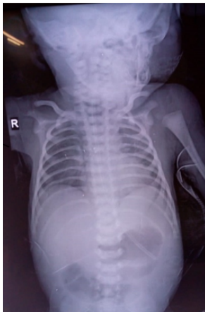
Fig. 1: X-ray of chest and abdomen showing dilated upper small bowel loops

In view of the clinical condition and investigations, the decision to perform laparotomy was taken. We found a jejunojejunal intussusception (a segment of about 3 cm) which was about 20 cm distal to duodeno-jejunal junction (Figure 2). Just distal to this, a segment of about 8 cm of jejunum was found to be gangrenous with multiple patchy areas of congestion. The peritoneal cavity had minimal free fluid but no bowel perforation was detected. The intussuscepted segment was resected as it was irreducible. No lead point could be detected on gross examination. Remaining bowel and viscera was unremarkable. Following resection of gangrenous part, Bishop Koop stoma with transanastomotic tube (TAT) was made (Figure 3). The histopathology of the resected jejunum showed scattered areas of mucosal ulceration, hyperemia and villous atrophy with hemorrhagic necrosis and leucocytic infiltration suggestive of ischemic necrosis. There was no evidence of lead point.