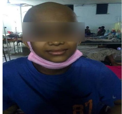
Fig. 4: Post chemotherapy reduction in size of supra clavicular mass