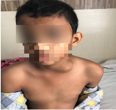
Fig. 1: Large lobular, supra clavicular mass