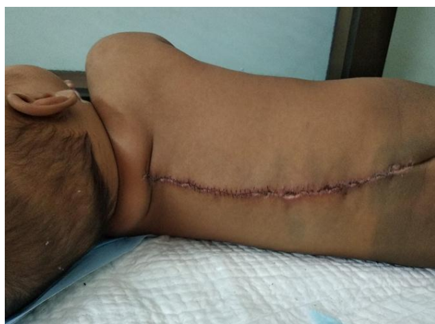
Fig. 3: Post-surgical scar of the patient underwent D7-S1 laminotomy with excision of tumor