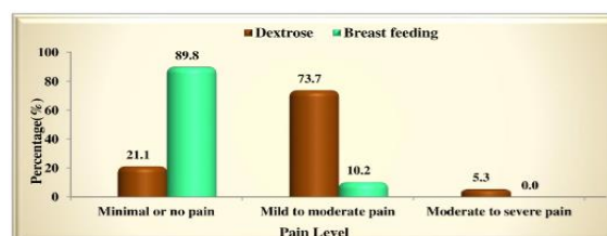
Fig. 1: Pain level among neonates of both groups

The overall pain score among 106 neonates ranged from 3 to 13 with overall average PIPP score was 7.4 \pm 3.3 out of the range 0-21. Overall pain level of neonates in both groups has been depicted in Fig. 1. In breast feeding group 89.8% children had no or minimal pain. In dextrose group maximum children 73.7% had reported mild to moderate pain.