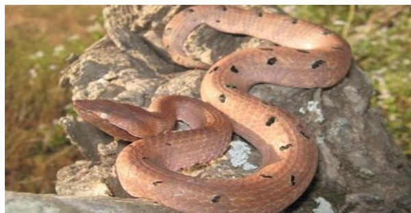
Hump nose pit viper