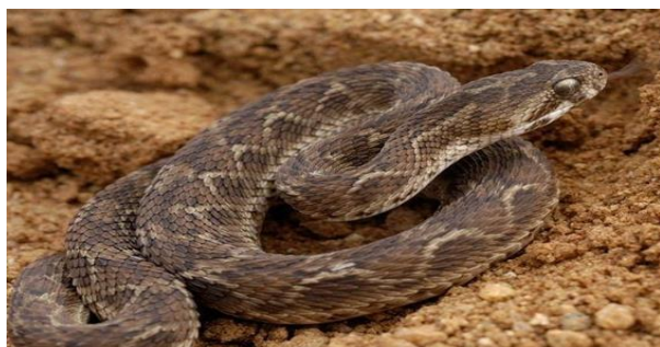
Saw Scaled Viper