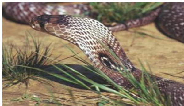
Indian spectacled cobra