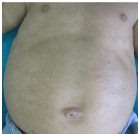
Fig. 2: Shows bilateral abdominal distension in flanks